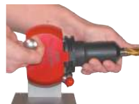
Horizontal Right Hand

Pull the indexing knob to unlock, turn into a new position, and release the indexing to lock.