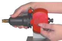
Horizontal Left Hand